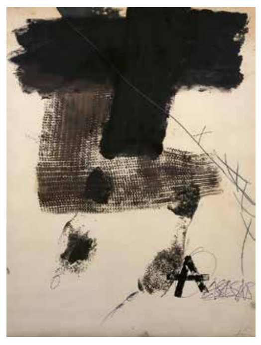
Antoni Tàpies. Empremta de màniga, 1974.