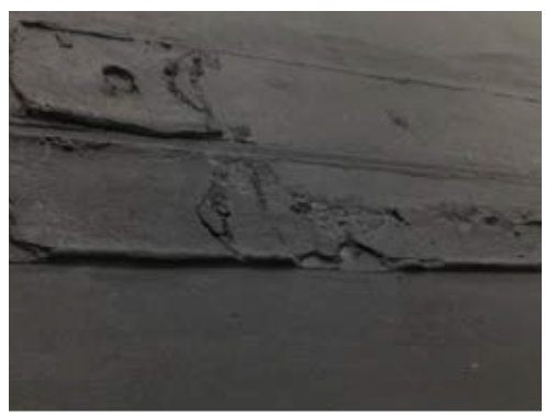
Noir aux deux arcs beiges, 1961