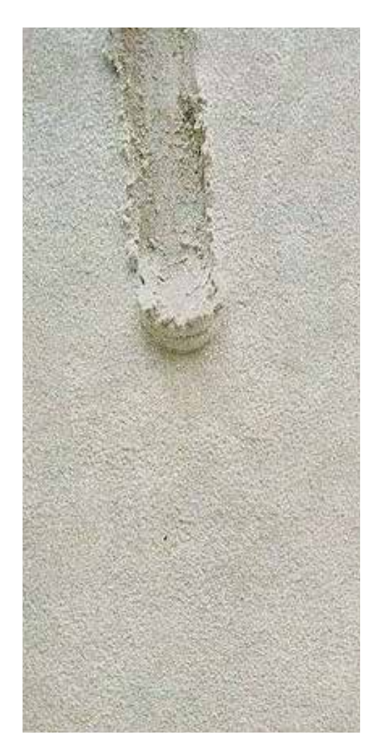
Give raw material such as cement, a soft story.