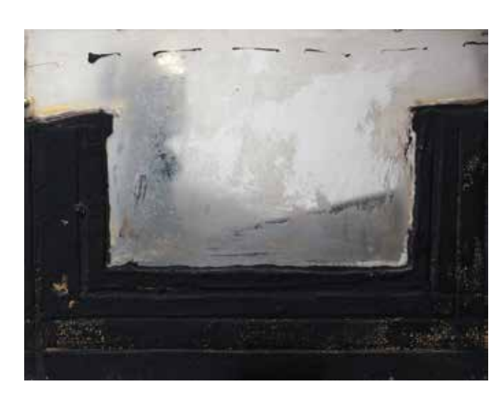
Antoni Tàpies, Matèria-mirall, 1993.