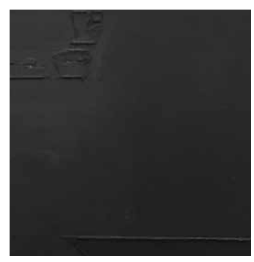
Dark mysterious artwork

Giving nature material a meaning? Give raw material such as cement, a soft story.