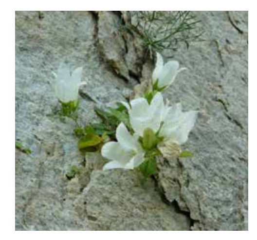
Metaphor: people are stronger than they think they are