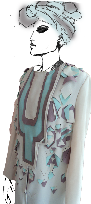
Lizet van der Knaap, 2015