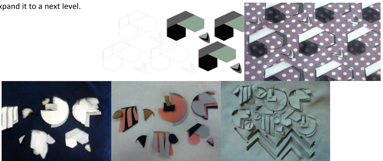
Test that I made with different materials and colors

The media that I will use for my craft are different layers of fabric. I want to use fabric that contains natural substances and polyester. I need this combination because I want to dye the fabric and a natural product will color. And I need polyester because I want to laser cut it, polyester is a plastic substance and if you laser cut it will burn the edges and it will melt to each other that the forms will have a nice, clean finishing and it has no change to fray. I have done already a lot of research about laser cutting fabric so I can use this knowledge and expand it to a next level.