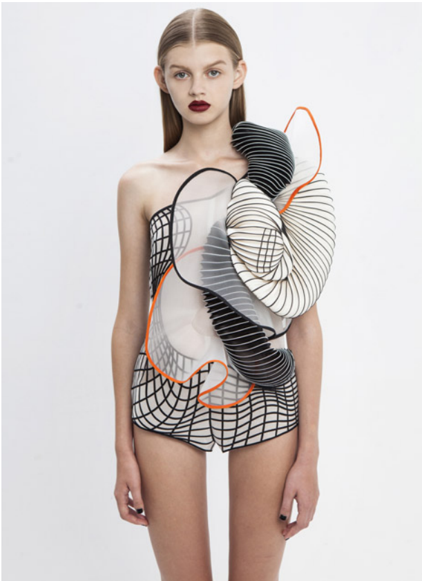
Noa Raviv, Hard copy collection, 2014

The contrast that she is using with color to create the 3D, voluminous and optical collection is for me a big inspiration and motivation to create something new. What she is also doing. The only thing, that I see as a problem is that you can't wear it in a commercial way.