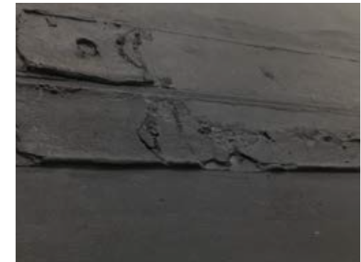
Noir aux deux arcs beiges, 1961