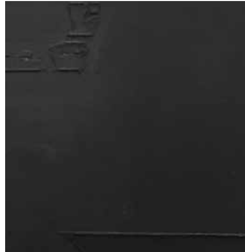
Dark mysterious artwork

Give raw material such as cement, a soft story.