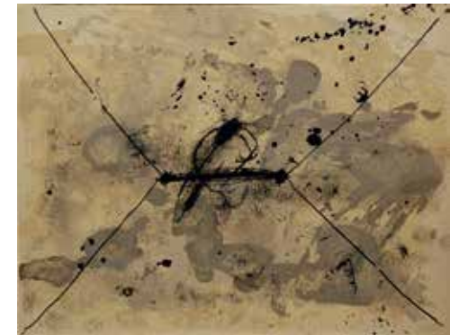
Antoni Tàpies, L'Enveloppe, 1968.