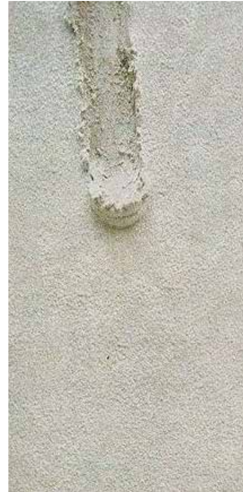
Give raw material such as cement, a soft story.