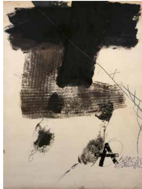
Antoni Tàpies, empremta de màniga, 1974.