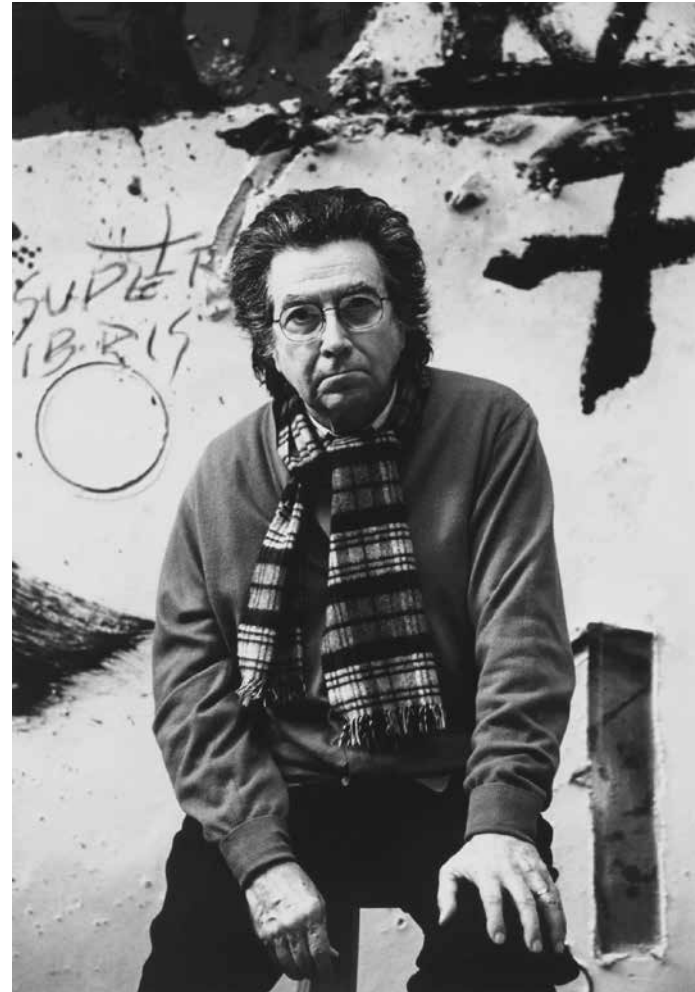
Antoni Tàpies, self portrait

Although the works are abstract, the spectator can always find something concrete in the art of Tàpies. The artist considered it important that there is something in the work that is directly related to life, an image, idea or suggestion.