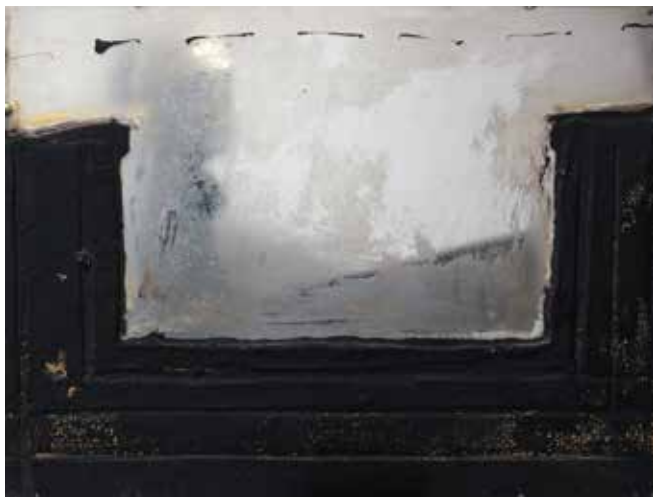
Antoni Tàpies, Matèria-mirall, 1993.