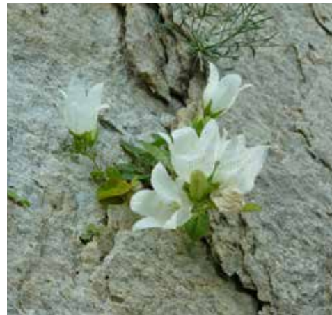
Metaphor: people are stronger than they think they are