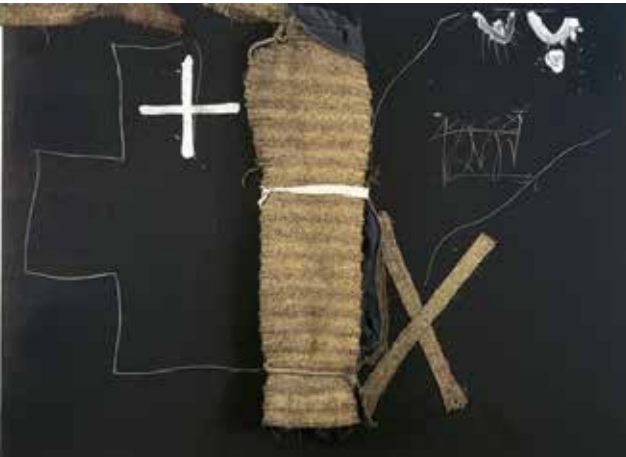
Antoni Tàpies, Embolcall, 1994.