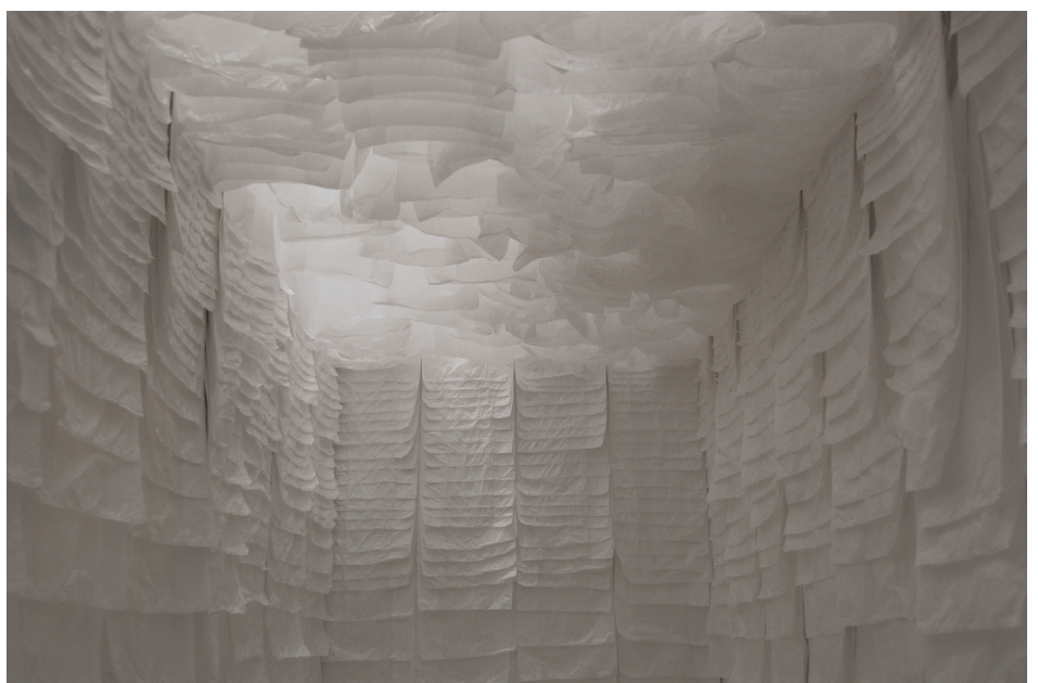
White shiver, WDKA 2013