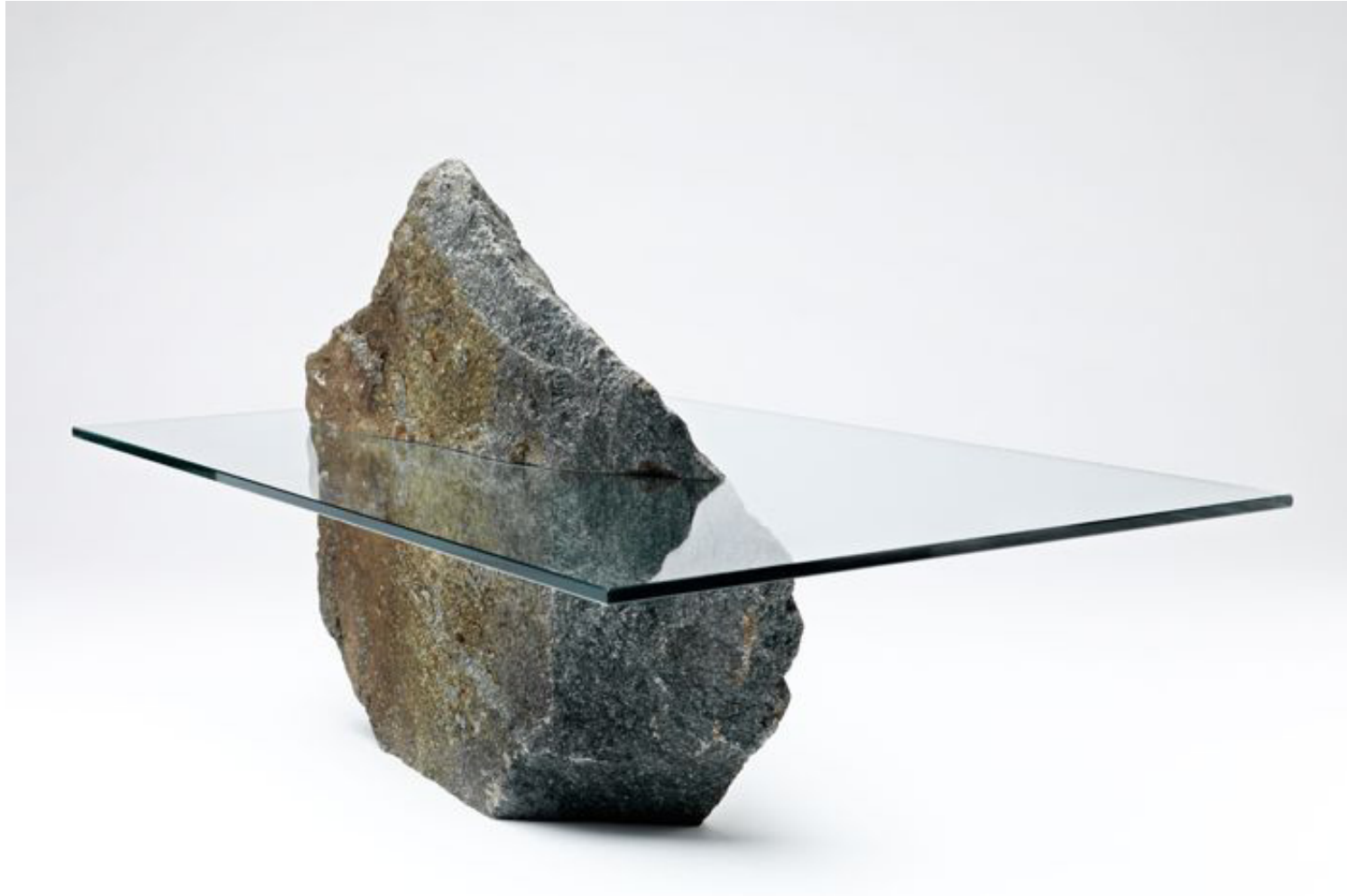
EAGLE WOLF ORCA - ARCHIPELAGO