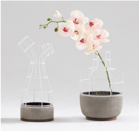
SEUNG YONG SONG