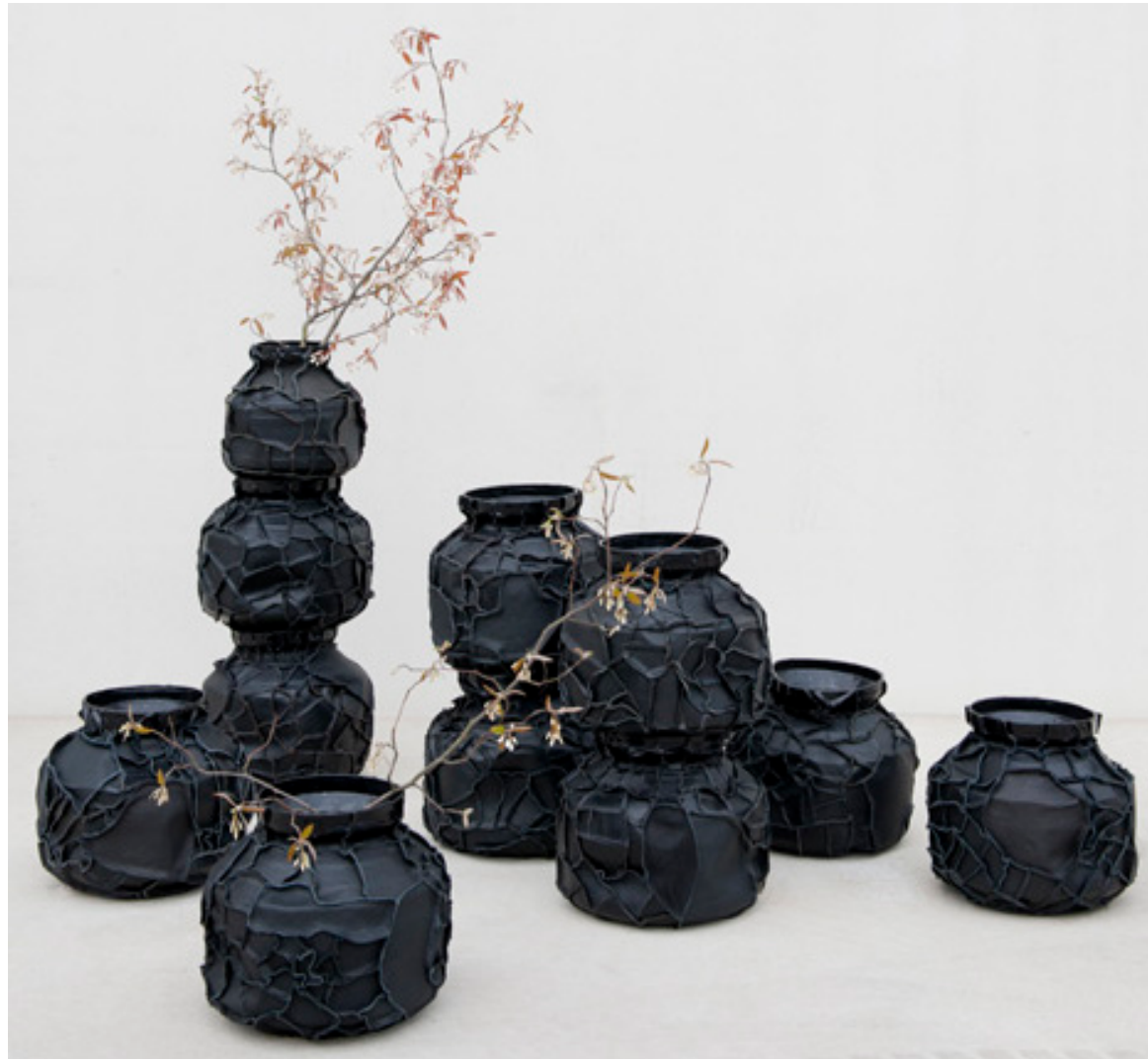
PEPE HEYKOOP _ MATKA VASES