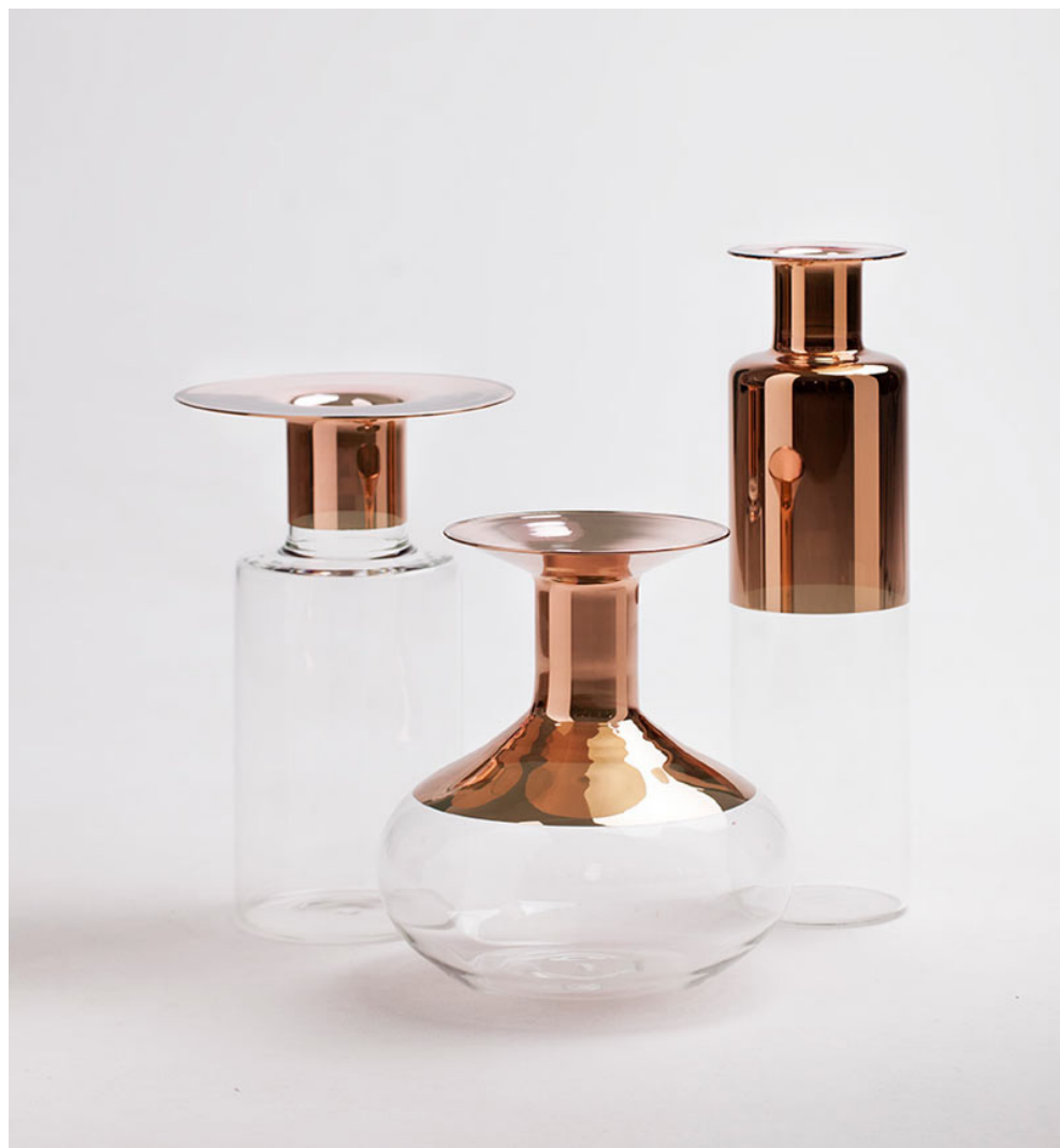
GIORGIO BONAGURO - TAPIO