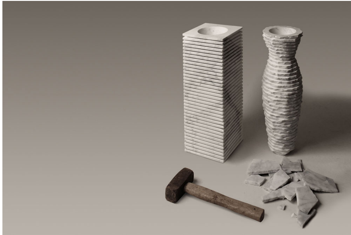
PAOLOULIA MORENO RATTI _ INTROVERSO2