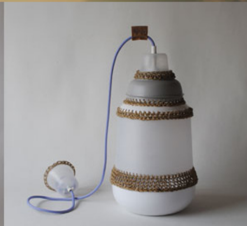
HOOKED ON IT