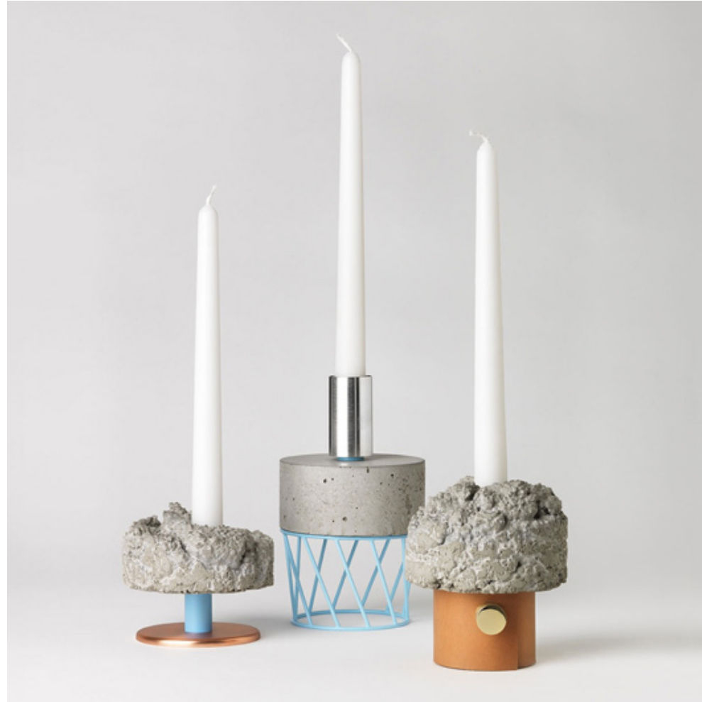
DAVID TAYLOR - CROWD12/13