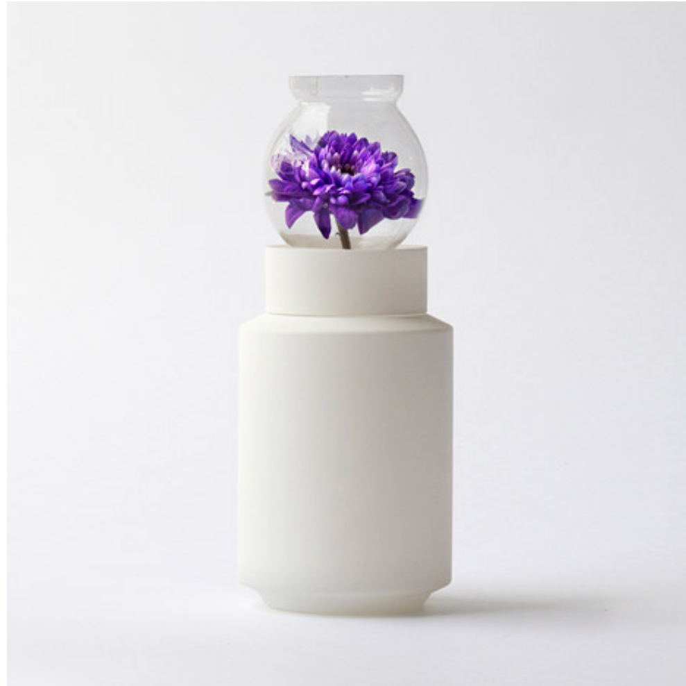
GIUSEPPE BESSERO BELTI _ 3DPRINTED EXPERIMENTA VASES