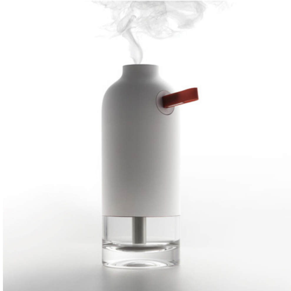
CLOUD AND CO - BOTTLE HUMIDIFIER