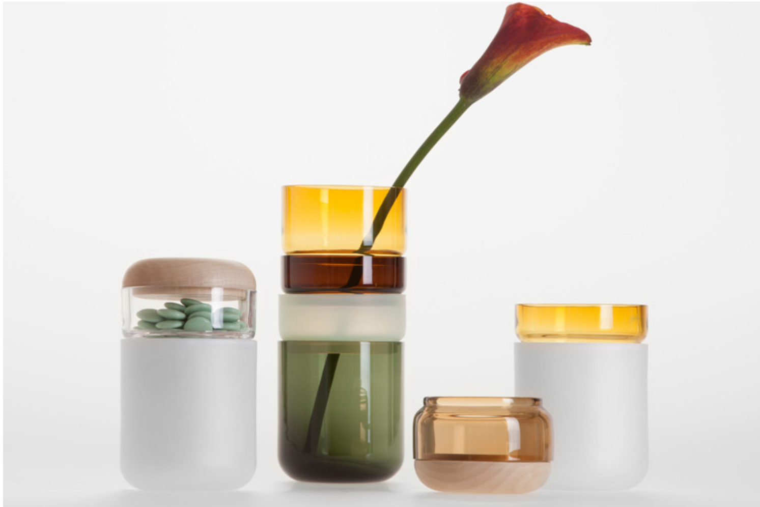
MAIJA PUOSKARI _ PINO PINO VASES