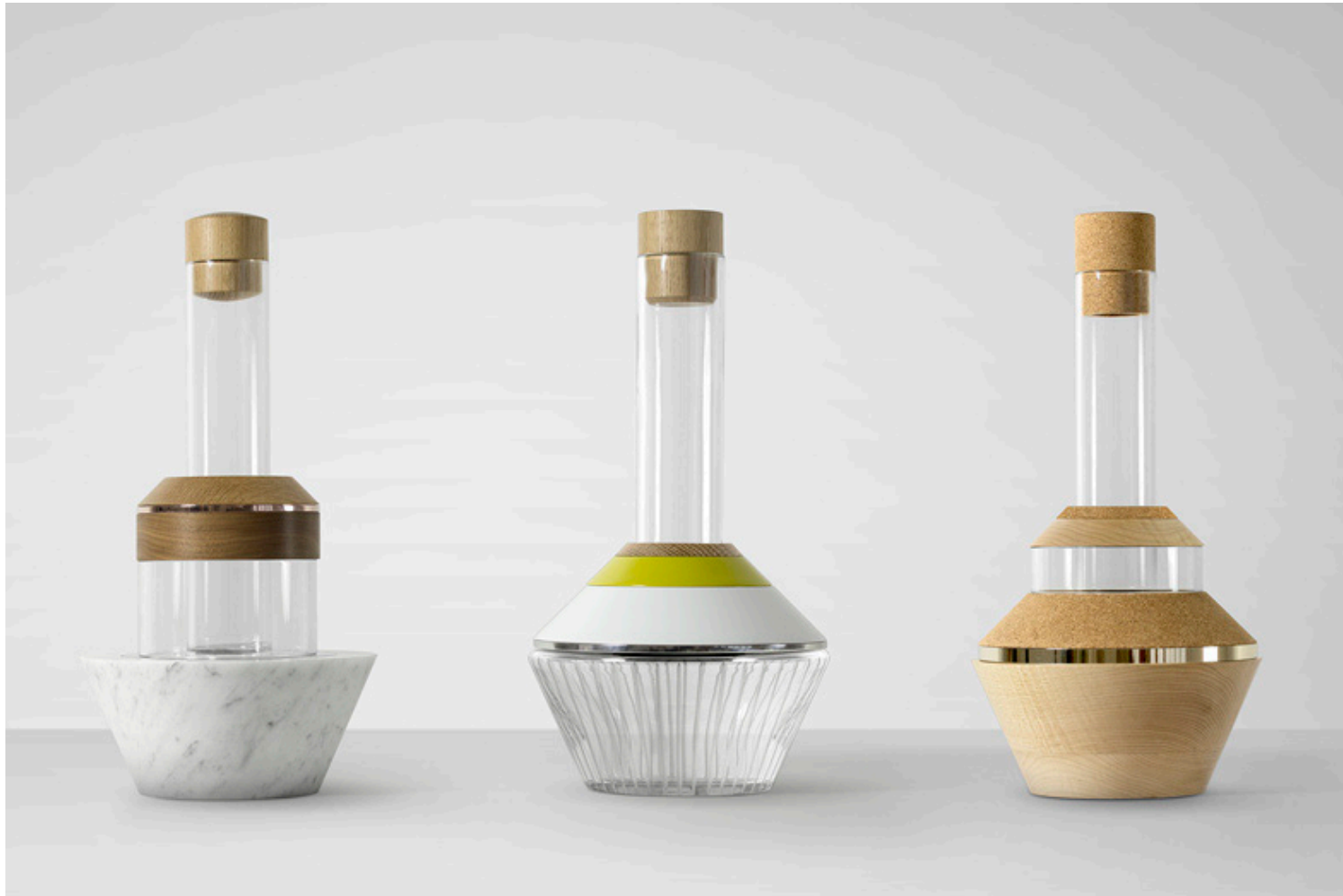
VITAMIN _ ELEMENT VESSEL