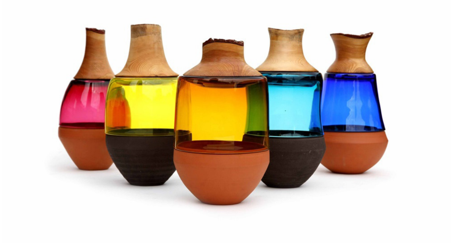
PIA WUSTENBERG _ STACKING VESSELS