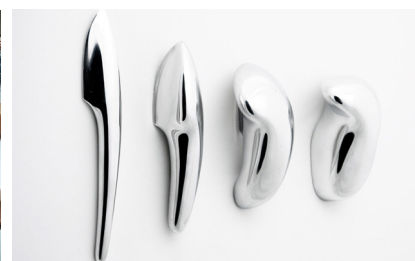
Image 3 Transition of the knife model